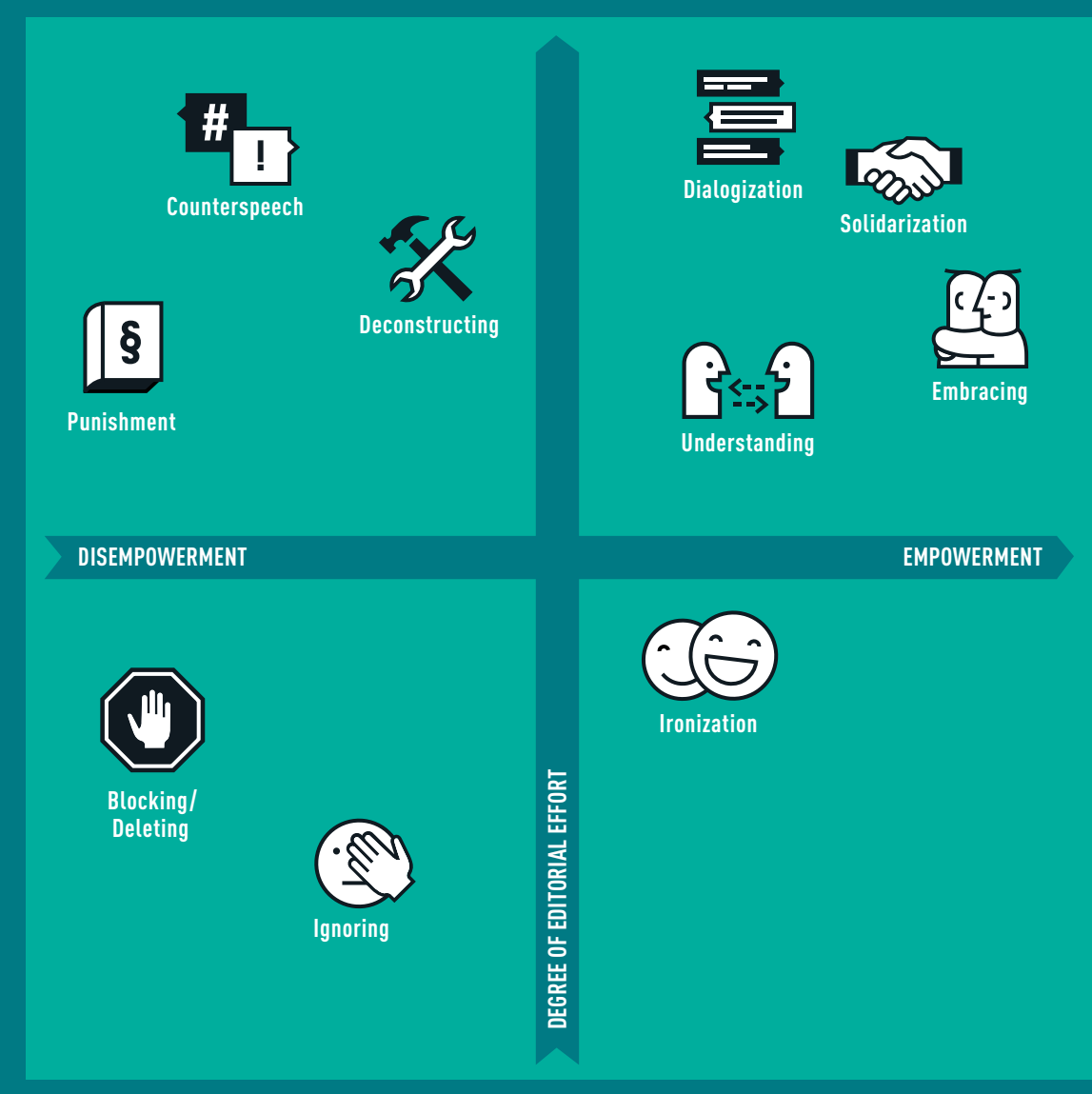
Figure 2: Editorial Moderation Strategies to Combat Hate Speech – Matrix of regulating and motivating moderation elements